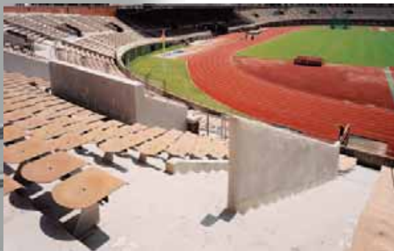
The tribunes at the Olympic Stadium in Amsterdam, the Netherlands.

Main pic above: From artists impression to... ...the installation of Bolidtop Sensation at Al-Sadd Sports Club in Doha, Qatar (far left).