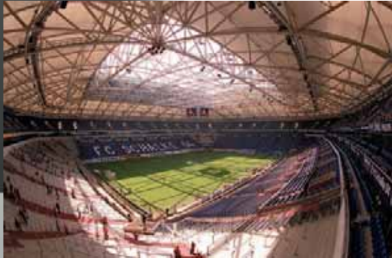
Schalke 04 stadium in Gelsenkirchen, Germany.